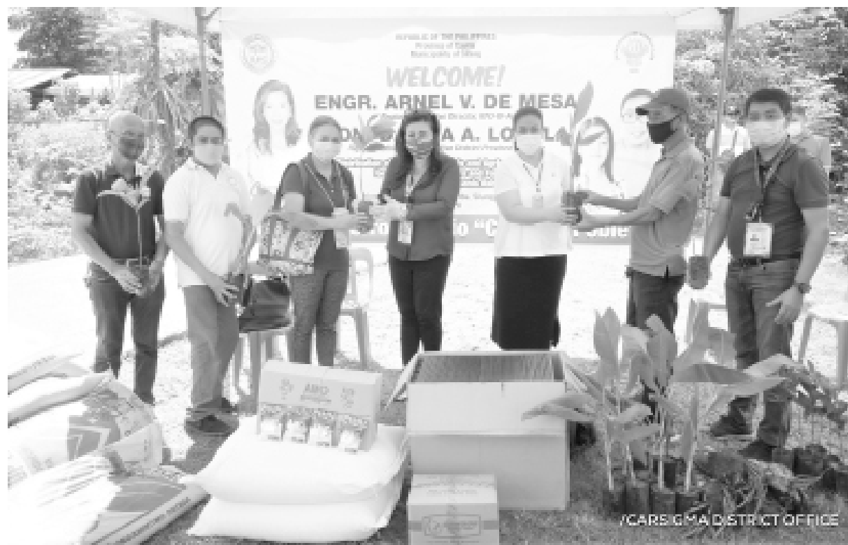
CAVITE CITY DISTRICT OFFICE

The farmers received 4,200 bags of Agricultural Lime, 800 bags of Plant Growth Enhancer, 25,000 pieces of Liberica-Coffee, 6,000 pieces of Banana Tissue Culture, Assorted Cut Flower and Vegetable Seeds, 1,200 Seeding Trays, Black Net and UV